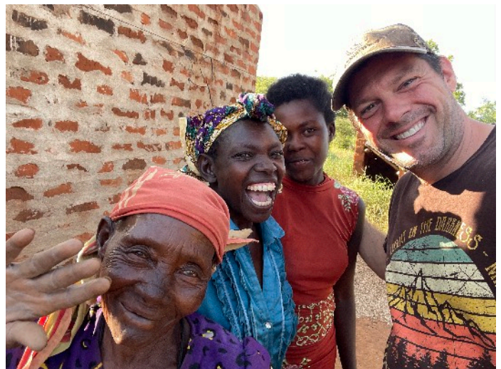
102 year old lady happy to have visitors